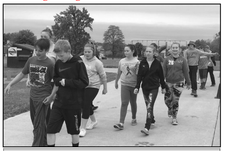
Gerke students participated in their annual Cystic Fibrosis Walk at the end of the year. The total amount raised was $588.50.