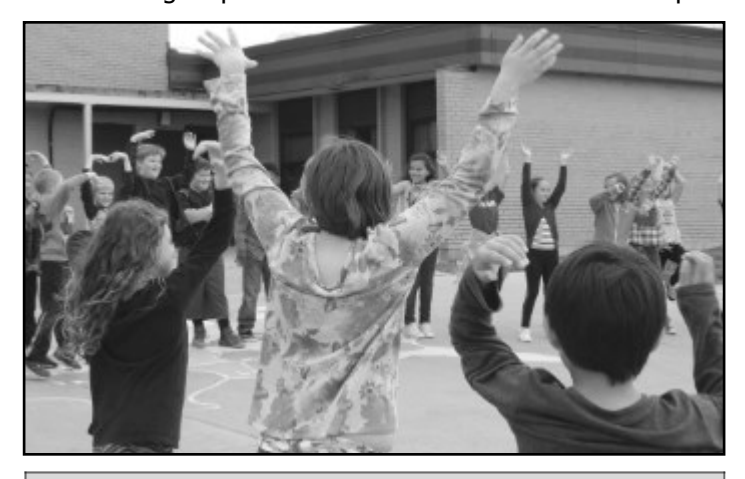
Above, a fun, interactive game breaks the ice!

Third graders at Pennyroyal and Schenck were paired up as pen pals to correspond all year. Students wrote once each month using guided writing topics, telling about themselves, and asking their pen pal questions. In May, Schenck students took a field trip to Pennyroyal to meet their pen pals, do some team building, and to have a picnic. Teachers noted that this early introduction to students from another building helps to break the ice at Sixth Grade Camp.